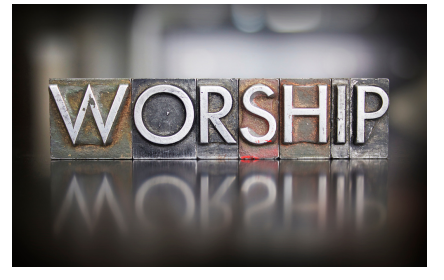
Sunday Order of Service SUNDAY MORNING WORSHIP @ 8:00AM SUNDAY SCHOOL @ 10:00AM SPANISH MINISTRY @ 11:30AM