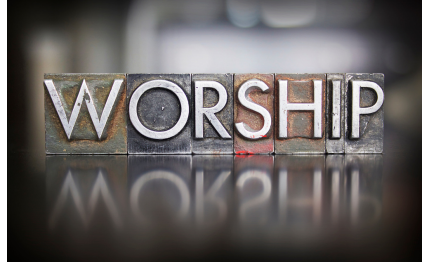
Sunday Order of Service SUNDAY MORNING WORSHIP @ 8:00AM SUNDAY SCHOOL @ 10:00AM SPANISH MINISTRY @ 11:30AM