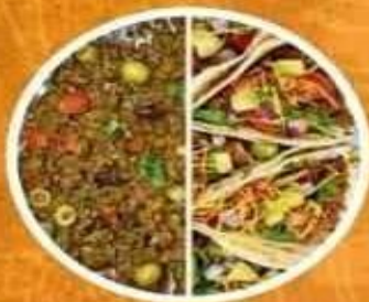
NORTH AMERICAN CUISINE