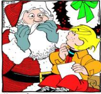
"I WOULDN'T HAVE PULLED ON YOUR BEARD IF I'D KNOWN IT WOULD COME OFF!"

According to researchers at Augusta University in Georgia, analyses of over 30 other studies into the long-trumpeted immune-boosting vitamin C show that it appears to be lacking in many patients who develop serious cases of COVID-19. Researchers say that coronavirus almost acts as accelerated aging, and that the drop in vitamin C levels elderly patients experience as part of the aging process could be a sign as to why they're more susceptible as a population to the disease.