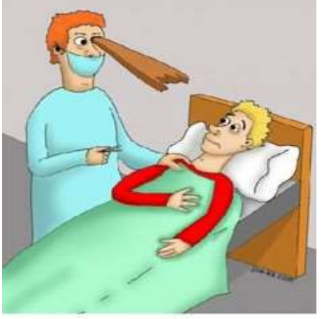
Let me take that speck out of your eye.