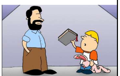
PAD, I NEED YOUR HELP TO FIND OUT WHERE IT TALK'S ABOUT THE EASTER BUNNY IN THE BIBLE

The connection between chronic neurological conditions and infectious viruses has long mystified scientists. In the wake of the 1918 Spanish Flu, an estimated 1 million people worldwide developed a mysterious, degenerative neurological syndrome known as encephalitis lethargica, which caused Parkinson-like muscle rigidity, psychosis and, in some cases, a zombie-like state. Neurologist-author Oliver Sacks featured the syndrome in a book that was the basis for the 1990 film Awakenings . The cause of its condition, which lingers for decades, is still not fully understood.